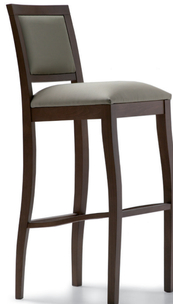
fin. EBA | TX 3021/23 - fin. NCA | TX 3021/13

“Una seduta versatile che permette di creare angoli di convivialità informale. Questo sgabello è caratterizzato da linee eleganti ed essenziali perfette per ambienti contemporanei.”