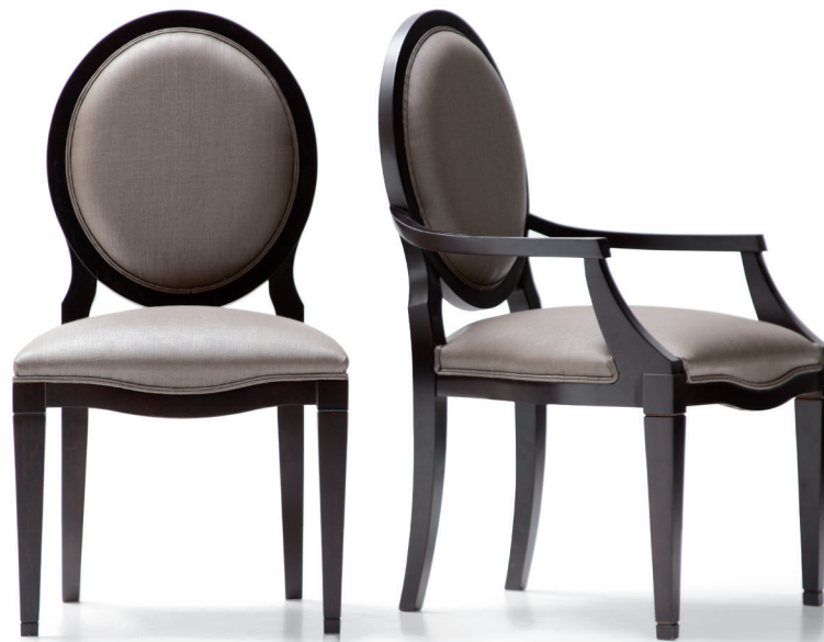
fin. WEN | TX 3027/7

Opera Contemporary | Design: Ufficio Tecnico