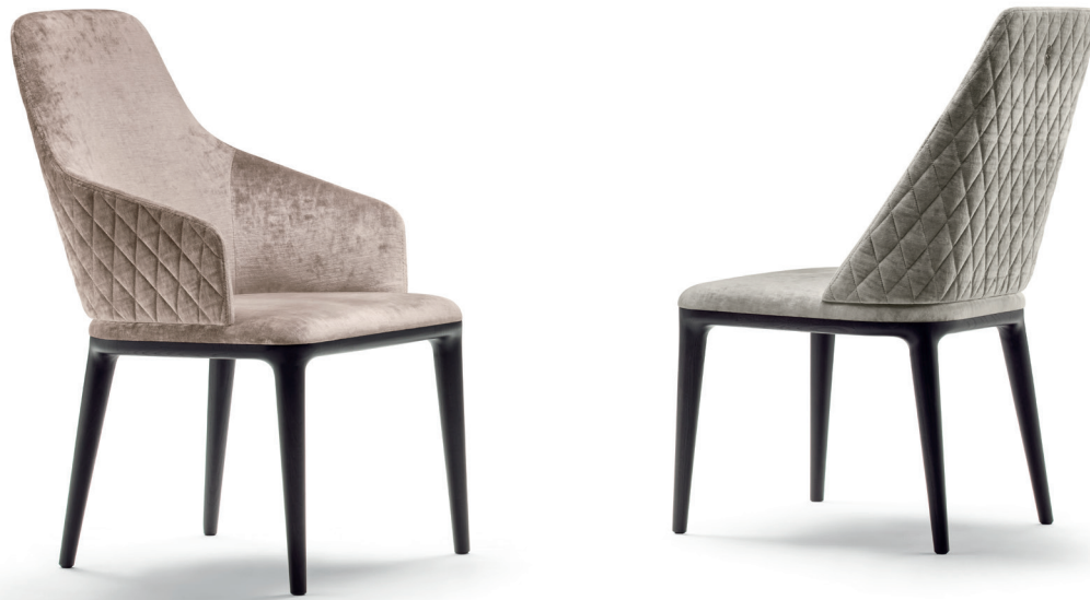
fin. EBA | TX 1022/33 - fin. EBA | TX 1022/11

“La sedia Hilary accosta linee essenziali e dettagli raffinati. La struttura lignea è flessuosa ed elegante e sorregge la seduta e lo schienale alto, quest'ultimo esaltato da una sofisticata lavorazione a rombi sul retro.”