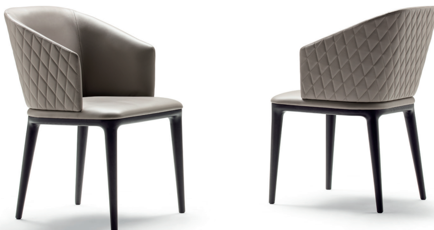
fin. EBA | PX 7541

“La seduta Louise è un pezzo dal design asciutto e l'estetica organica, scandito da una struttura in legno di frassino massello completamente ingegnerizzata e rifinita a mano. Presenta una seduta imbottita e uno schienale trapuntato a rombi sul retro.”