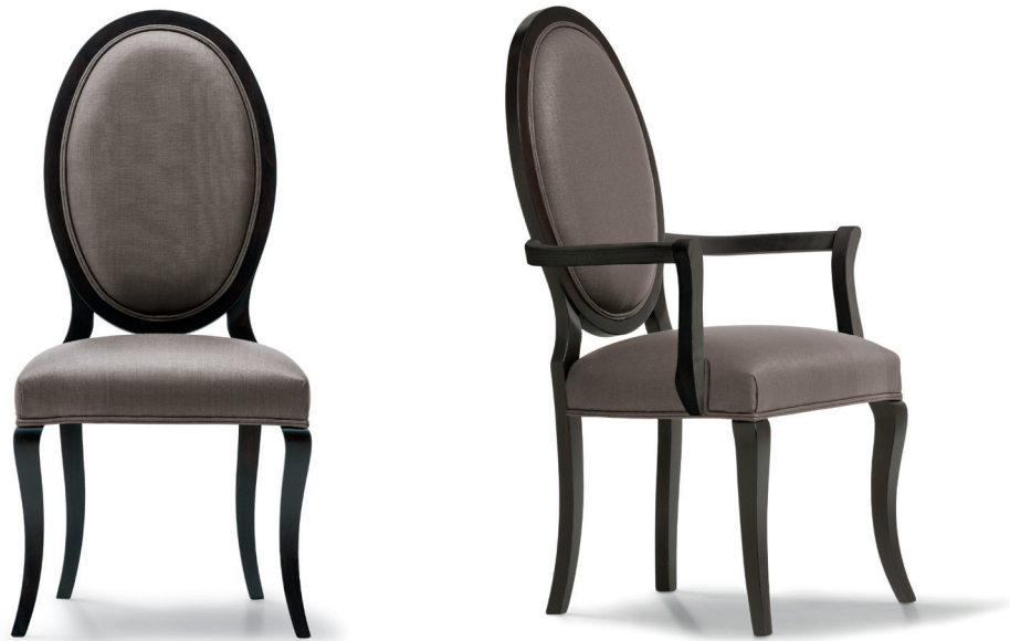
fin. WEN | TX 3022/7

Opera Contemporary | Design: Ufficio Tecnico