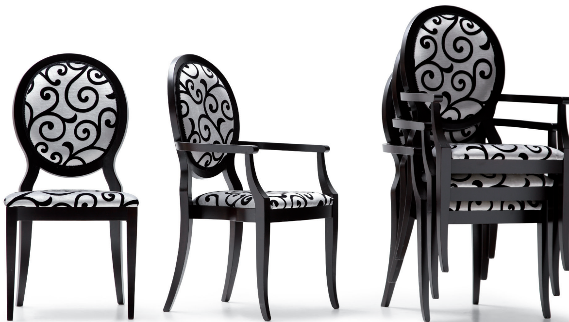
fin. EBA | TX 3318/11

Opera Contemporary | Design: Ufficio Tecnico