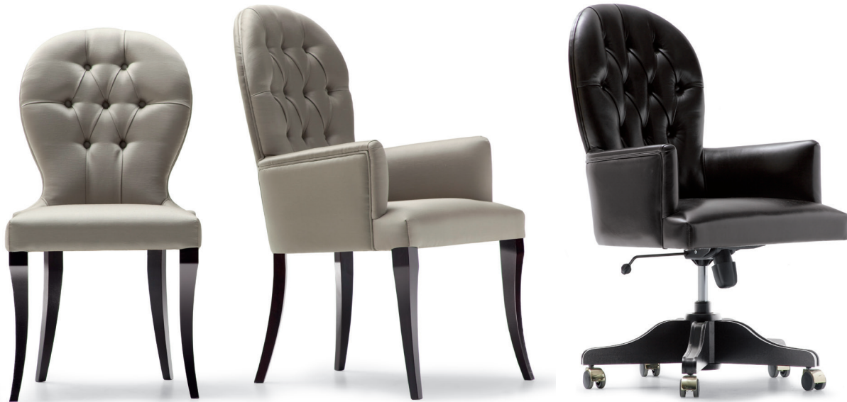
fin. EBA | TX 3021/23 - fin. EBA | PX 2402

Opera Contemporary | Design: Ufficio Tecnico