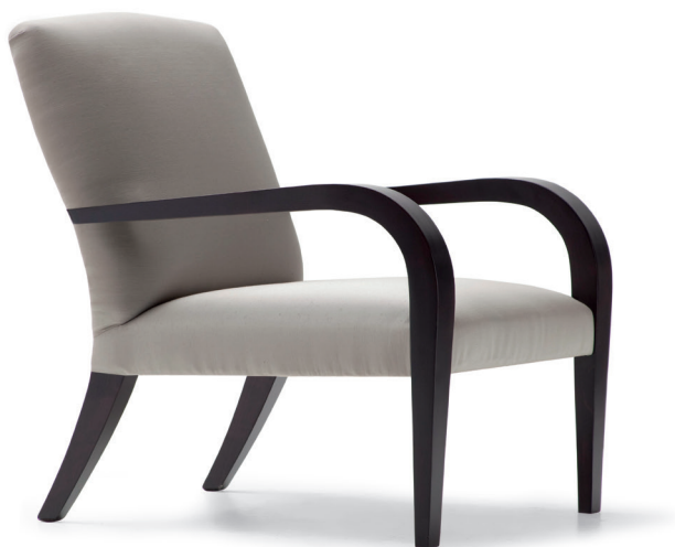
fin. EBA | TX 3021/23

Opera Contemporary | Design: Ufficio Tecnico