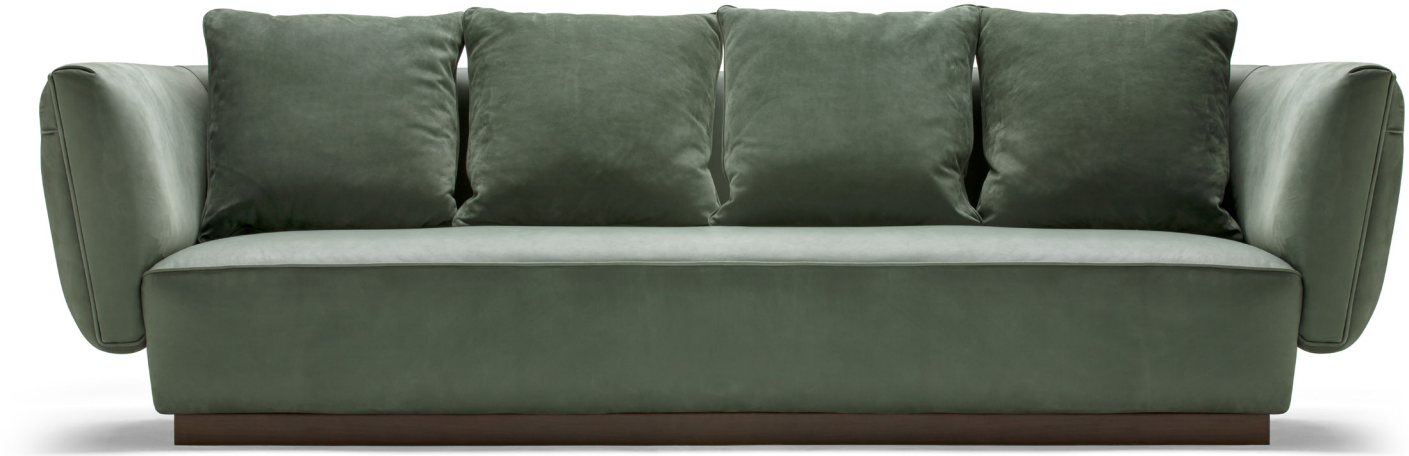
fin. WEN I PX 7211

“Allure sofisticato e fascino contemporaneo per Simon, un divano a tre posti dalle proporzioni eleganti arricchito dalla lavorazione capitonè sul profilo esterno dello schienale che avvolge con delicatezza le ampie sedute. La collezione include un divano a due posti.”