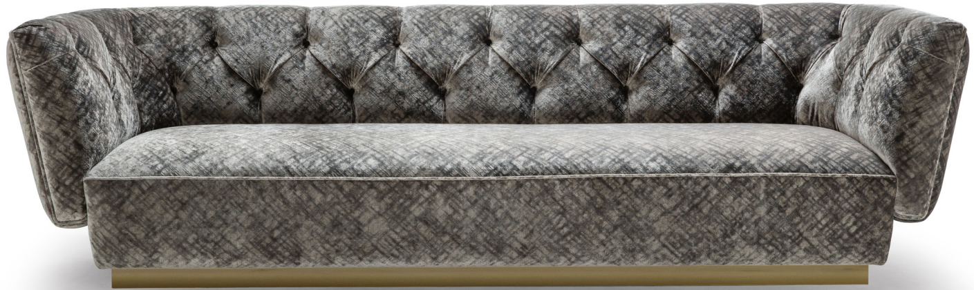
fin. VMS I TX 4124/33

“Allure sofisticata e fascino contemporaneo connotano la cifra progettuale della seduta Ivonne, un divano a tre posti dalle forme proporzionate esaltate dalla lavorazione capitonnè nel lato interno dello schienale, che avvolge dolcemente l'ampia seduta. Un pezzo d'eccezione che garantisce al contempo comfort ed eleganza. La collezione include un divano a due posti.”