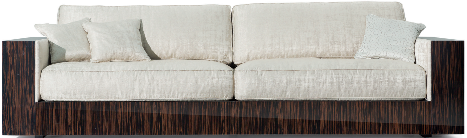
fin. NOP | TX 4031/1

Opera Contemporary | Design: Ufficio Tecnico