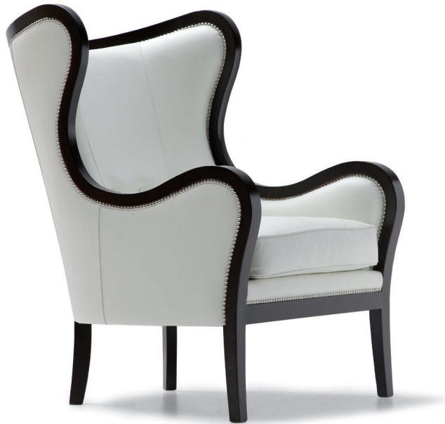
fin. WEN I PX 2402

Opera Contemporary | Design: Ufficio Tecnico