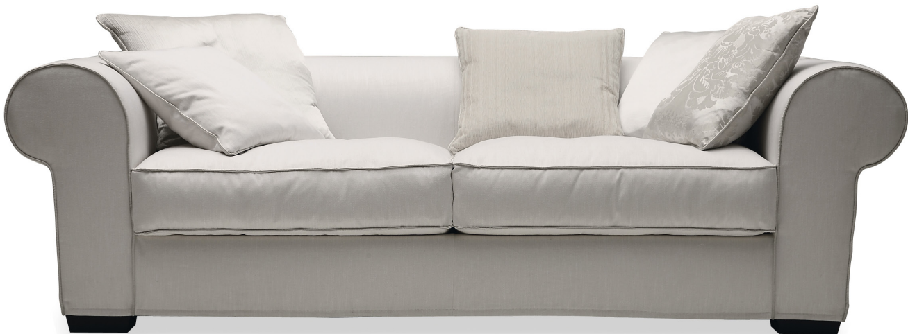
fin. WEN | TX 1026/1

Opera Contemporary | Design: Ufficio Tecnico