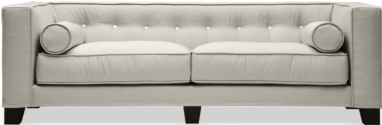
fin. WEN I TX 3026/11

“Un divano a tre posti dai volumi semplici, invitanti, accoglienti che nasconde una struttura in legno. I profili lineari della collezione sono esaltati da un dettaglio originale: bottoni in madreperla impreziosiscono lo schienale donando carattere all’articolo. La collezione include un divano a due posti.”