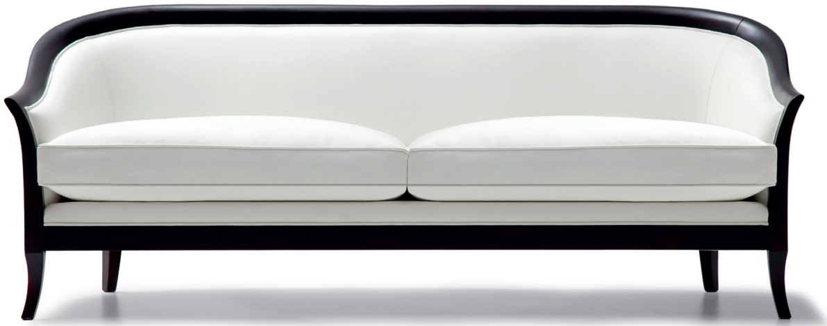
fin. EBA | PX 201

Opera Contemporary | Design: Ufficio Tecnico